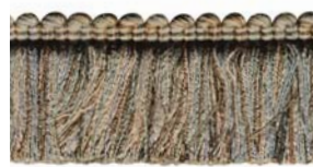
January Ruche Fringe Size: 4cm