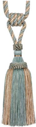
August Tie-Back Size: 26cm