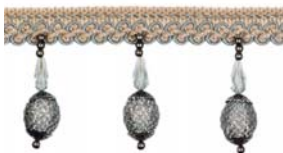
December Beaded Fringe Size: 7.5cm