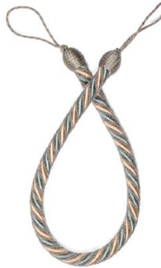
September Tie-Band Length: 103cm