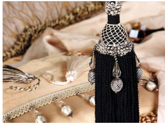
colour shown: twilight & alpine

A spectrum of 17 colours, featuring exclusive designs of the highest quality and an amazing price point.