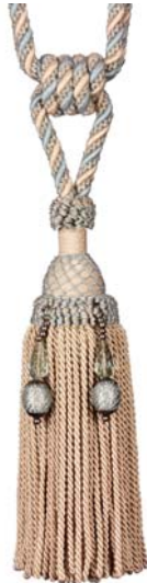
October Tie-Back Size: 24cm