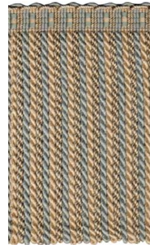
July Bullion Fringe Size: 22cm