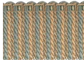
June Bullion Fringe Size: 10cm