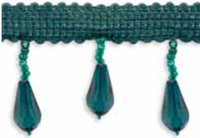
Songbird Beaded Fringe Size: 3cm