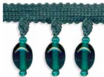
Paper Moon Beaded Fringe Size: 3.5cm