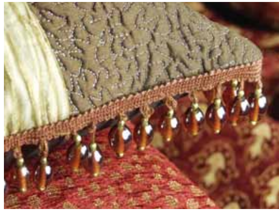
colour shown: amber

A beaded trim range designed with an ethnic quality, available in stunning rich jewel colours. The Paper Moon beaded fringe is made with glass beads.