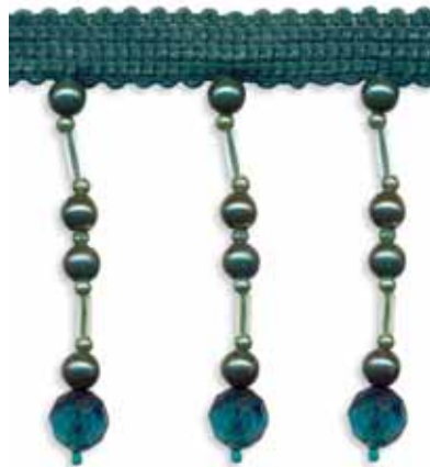
String of Pearls Beaded Fringe Size: 5.5cm