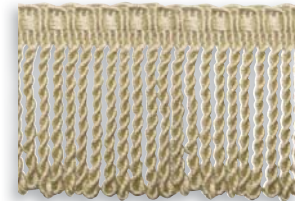
Andromeda Bullion Fringe Size: 5cm