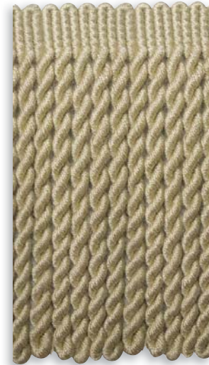
Zenith Bullion Fringe Size: 12cm