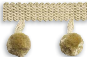
Supernova Pom Pom Fringe Size: 5.5cm