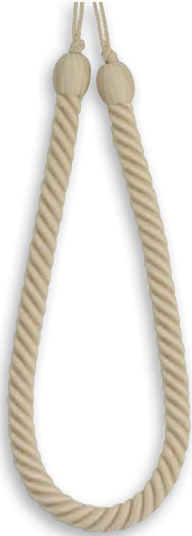
Planet Tie-Band Size: 103cm