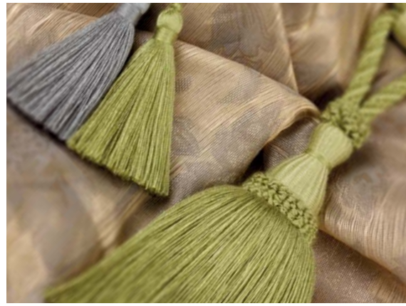
colour shown: vortex & cosmic

This collection has been introduced after receiving many enquiries for a matt version of our popular Solar range (see page 22). The results are beautiful trimmings of the best quality with an amazing price, with updated colour scheme and new articles.