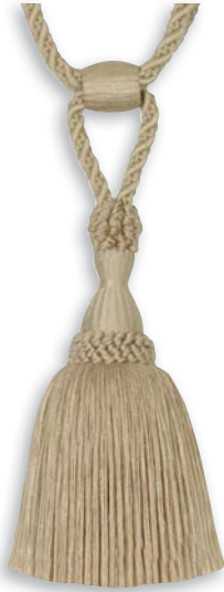
Universe Tie-Back Size: 20cm