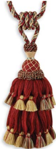
3139-10 Single Tie-Back Size: 23cm