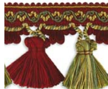
1825 Tassel Fringe Size: 7cm