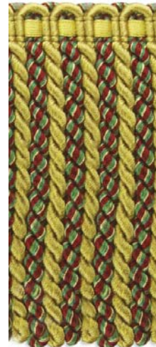
1603 Bullion Fringe Size: 15cm