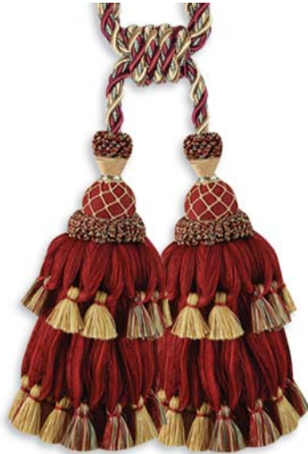
3139-20 Double Tie-Back Size: 23cm