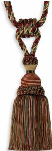
3076-10 Single Tie-Back Size: 20cm