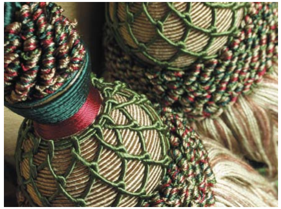
colour shown: 7836

The ultimate classic design using a yarn in rich golds, creams and royal primary colours. With a choice of ornate tie-backs, the collection brings a regal feel to any interior.