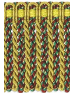
1647 Bullion Fringe Size: 6cm