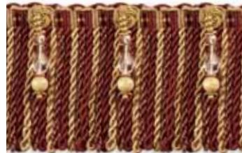
Boreal Fringe Size: 9cm