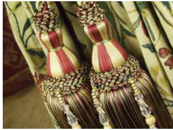
colour shown: carnation

All products in this range are decorated with cut plexiglass pendant beads at the top and are supported by small brass balls and crystal style beads finished at the base with a small round wooden bead.