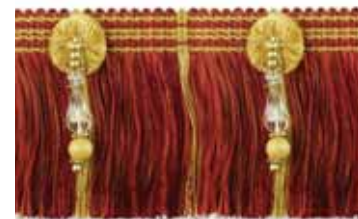
Sherwood Fringe Size: 8.5cm