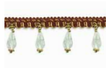
Bodmin Beaded Fringe Size: 3.5cm