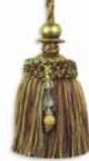
Congo Key Tassel Size: 11cm