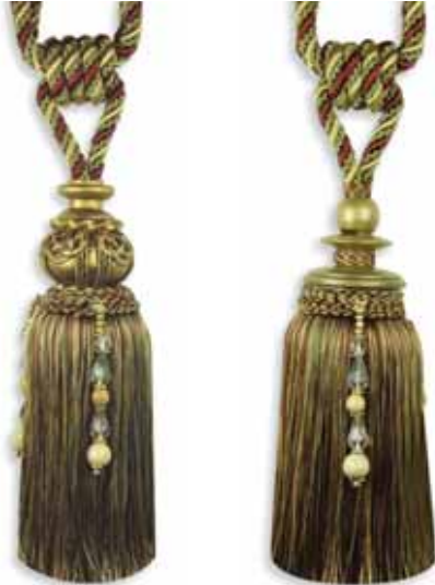
Amazon Single Tie-Back Size: 21cm