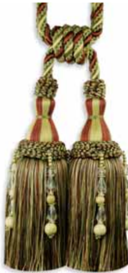
Siberia Double Tie-Back Size: 21cm