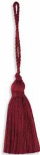
Buckingham Key Tassel Size: 8cm