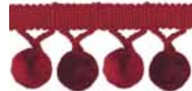
Holburn Ball Fringe Size: 5.5cm