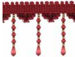
Ealing Beaded Fringe Size: 9cm