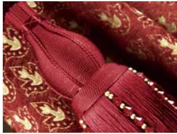
colour shown: burgundy

A stunning range of 11 designs each in a choice of 9 beautiful colours. Beaded tie-backs, trims and key tassels complete this collection that complements any decor scheme.