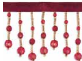
Kensington Beaded Ribbon Size: 5.5cm