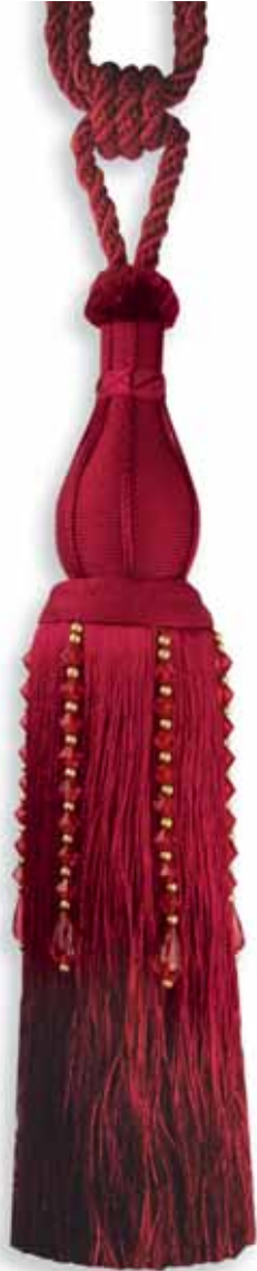
Dorchester Tie-Back Size: 35cm