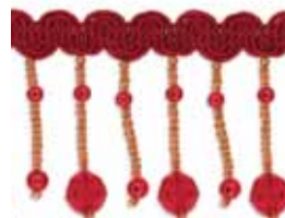
Chelsea Beaded Fringe Size: 4.5cm