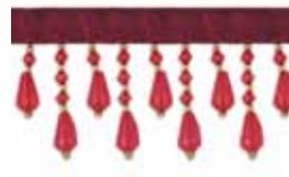
Richmond Beaded Ribbon Size: 4cm